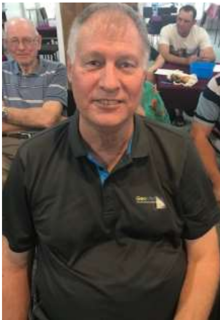
the new "boss"